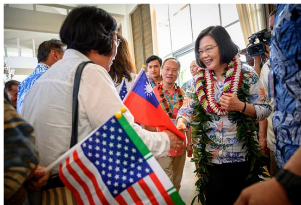
Taiwanese President Tsai Ing-wen, right, arrives in Hawaii on March 27, 2019.

We are also bolstering our partnership with the U.S. Overseas Private Investment Corp. with the belief that the combination of American private equity and Taiwanese development expertise can make substantial contributions to enhancing the prosperity of Taiwan's diplomatic allies and regional partners.