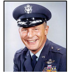
December 2021 Volume 4, Issue 11

Post email address: amerilegionth01@gmail.com