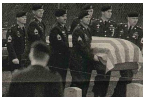
Martha Raye's funeral

Raye died in 1994 at the age of 78. Her last wish was that she be buried at Fort Bragg with many of her hero's. She was buried I October 1994 with full military honors, the only woman interred there.