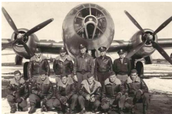
The crew of the B-29. Sgt Erwin is second from right, front row

On this mission while pulling the pin of a bomb and releasing it down a chute, the bombs fuse lit the phosphorus too fast and soon was burning at higher than 2,300 deg F. To make matters worse, the bomb jumped back into the plane, hitting Sgt Erwin in the face. He was blinded and his nose and ear were burned off. Smoke immediately filled the plane and no one could see including the pilot.