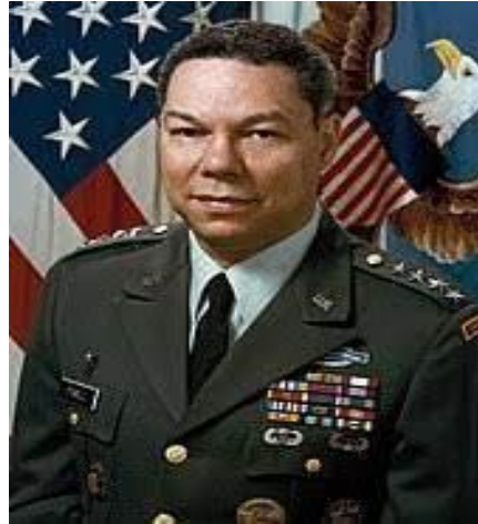
General Colin Powell