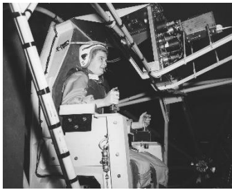
Jerri Cobb

from California to Paraguay. By 1960 she had logged 10,000 hours in the cockpit, twice that of astronaut John Glenn.