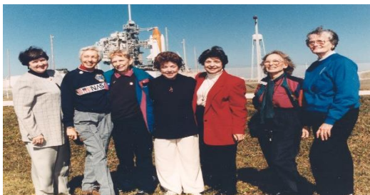
Seven of the original women Astronauts

When NASA introduced its first astronaut corps in 1959, it was strictly a men's only club. Although women weren't explicitly barred from the "Mercury Seven," NASA's requirement that astronauts be experienced military jet test pilots, a job open only to men, effectively prevented their selection.