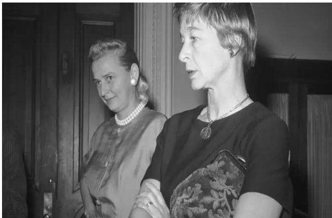
Two pilots, Jerri Cobb (left) and Jane Hart, are shown at the Capitol after warning Vice President Johnson that Russia will put the first woman astronaut into space unless the U.S. moves quickly. They sought a program which would enable the U.S. to launch a feminine astronaut that summer.

The Mercury 13 were ready to undergo space flight simulation at a navy facility in Florida. Days before leaving they learned that the program was cancelled once the navy learned the program was not sponsored by NASA. Credit to the History Channel.