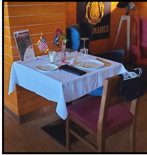
Post's Missing Man table