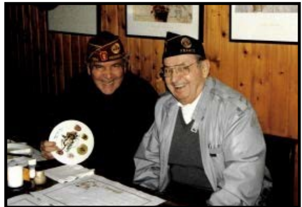
Past Post members with the plate in 1991