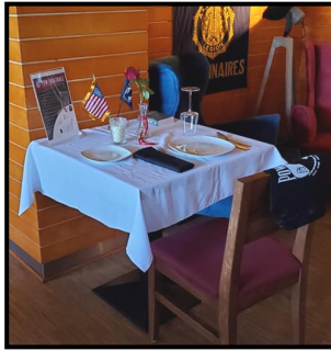
Missing Man table at Thanksgiving Dinner