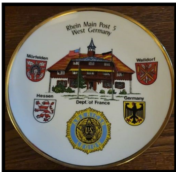
Straight from the original Box!

This plate is over 20 years old and in perfect condition. You can buy a plate of your own from Commander Santos; contact him for more info. (He will have them for sale at the next meeting!)