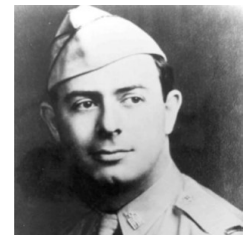
Clockwise: Lt. George L. Fox, Lt. Alexander D. Goode, Lt. Clark V. Poling, Lt. John P. Washington