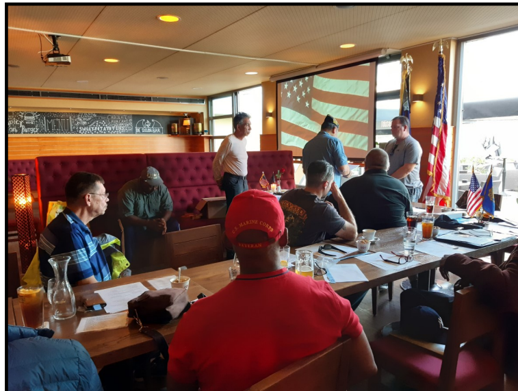
Left, Members of GR05 participate in October's meeting