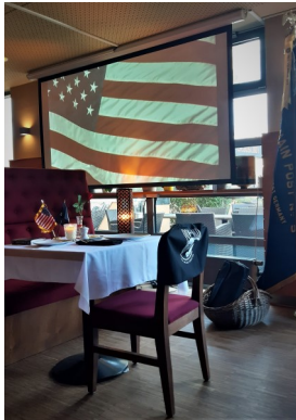
Our Missing Man table at October's Meeting