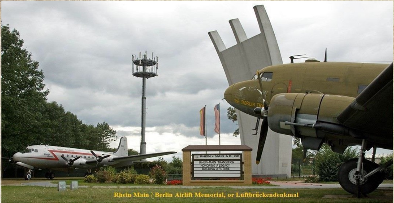
Rhein Main / Berlin Airlift Memorial, or Luftbrückendenkmal