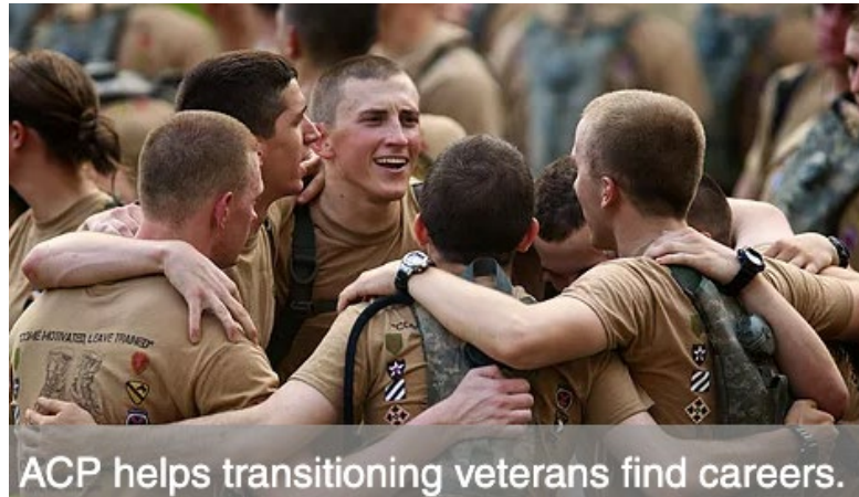
ACP helps transitioning veterans find careers.