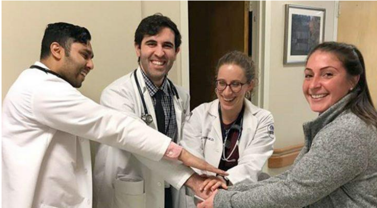
The importance of VA's Office of Academic Affiliations

Through OAA, VHA partners with medical schools, universities and colleges to provide training programs at VHA facilities. As a result of that partnership, VA Bedford Healthcare System's