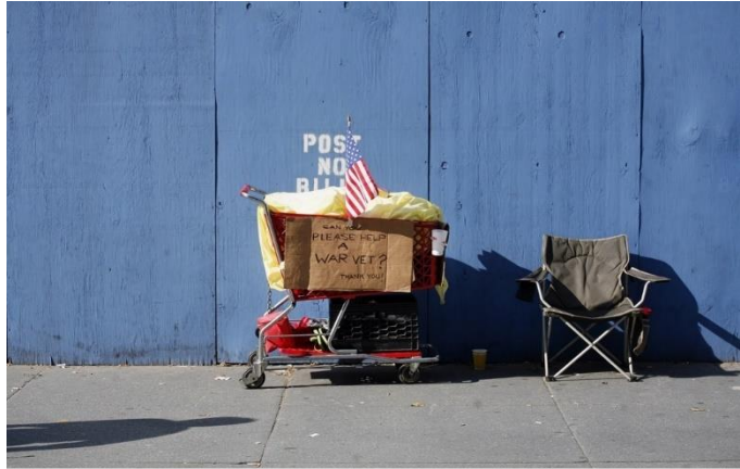
The grocery cart and chair of a person experiencing homelessness is shown along Fifth Avenue during New York City's annual Veterans Day parade in 2006.

But the figures have largely plateaued since then, and in March officials from the Department of Housing and Urban Development announced that the number of veterans without stable housing across the country rose slightly from 2019 to 2020, to about 37,250 individuals.