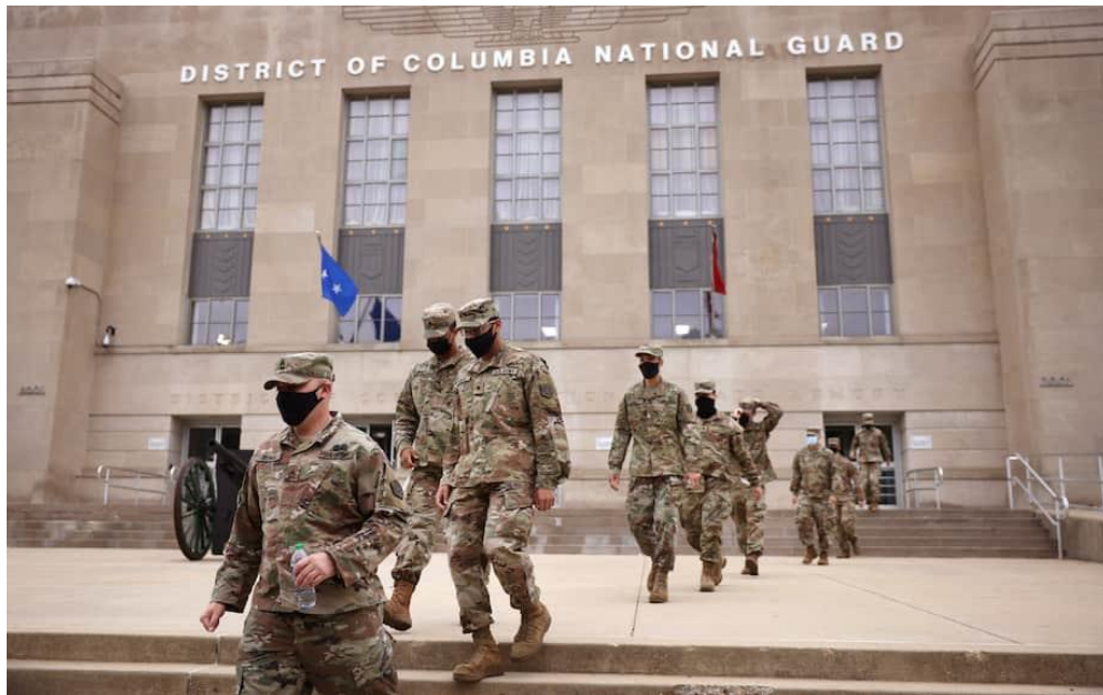
More than 50,000 Guard soldiers and airmen have gained VA loan eligibility because of the legislative change, according to estimates from the National Guard Association of the United States.

The VA loan program, popular with members of the military and veterans because they can buy a home without a down payment or mortgage insurance, was broadened by legislation signed in January to make it easier for members of the National Guard to qualify for the loans.