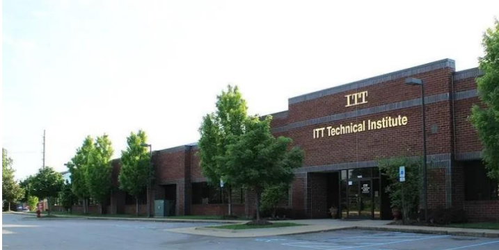
Biden's Education Department just cancelled $500 million of student debt for 18,000 defrauded borrowers.

The U.S. Department of Education (Department) announced today the approval of 18,000 borrower defense to repayment (borrower defense) claims for individuals who attended ITT Technical Institute (ITT). These borrowers will receive 100 percent loan discharges, resulting in approximately $500 million in relief. This brings total loan cancellation under borrower defense by the Biden-Harris Administration to $1.5 billion for approximately 90,000 borrowers.