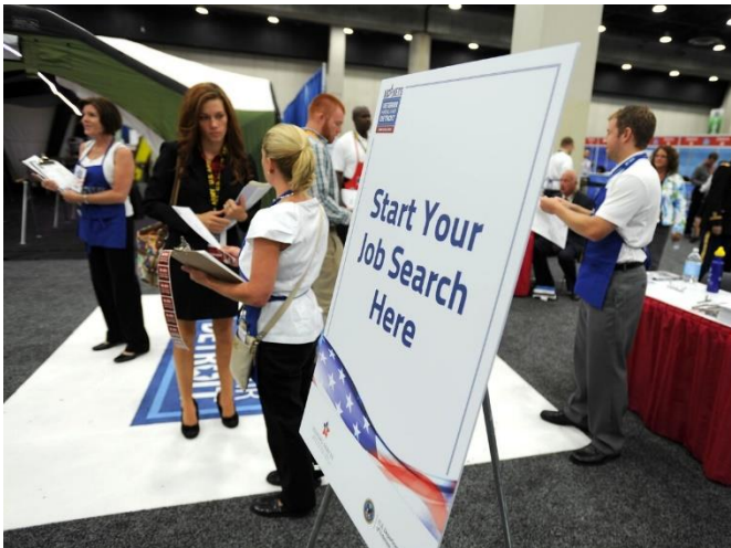
Staff from the Veterans Affairs' Employment Services Office take part in a hiring fair in 2012.

Veterans Affairs officials aren't pushing for new job training programs to help counter lingering employment challenges from the coronavirus pandemic, but they are eyeing expansion of existing ones as demand grows.