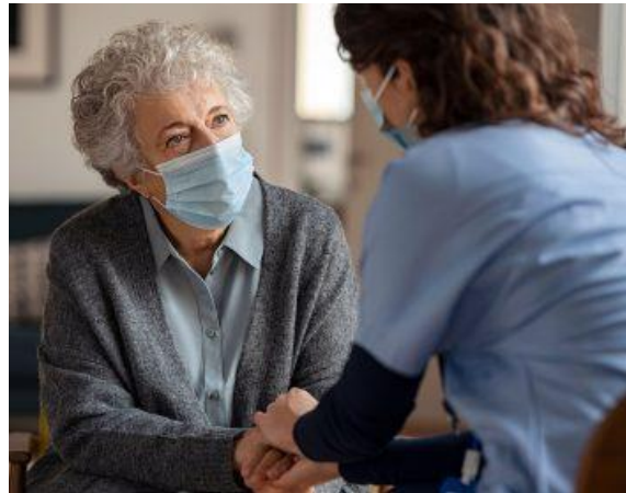
VA Bedford was a preferred destination for fellowship geriatrics.

VA develops new standards of care for health conditions commonly experienced by Veterans. And VA-trained clinicians continue to employ these innovations as they care for non-Veteran patients throughout their careers.